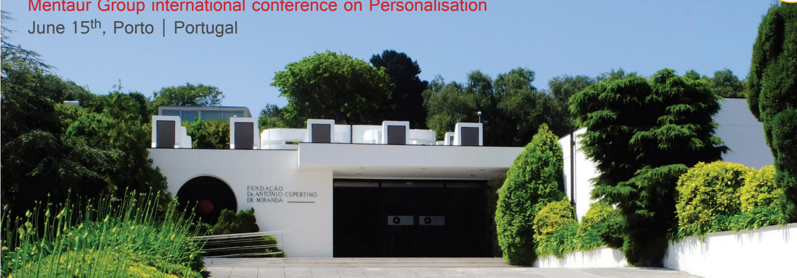
Image: The venue - Fundação Cupertino Miranda

On 15 th June, Mentaur hosted an international conference on personalisation at the Fundação Cupertino Miranda in Porto, Portugal.