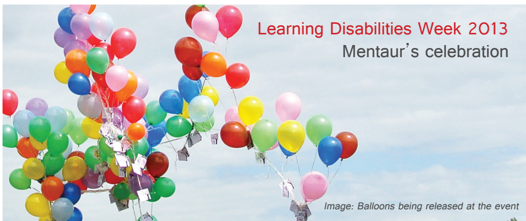
Image: Balloons being released at the event

Once the activities were finished, it was time