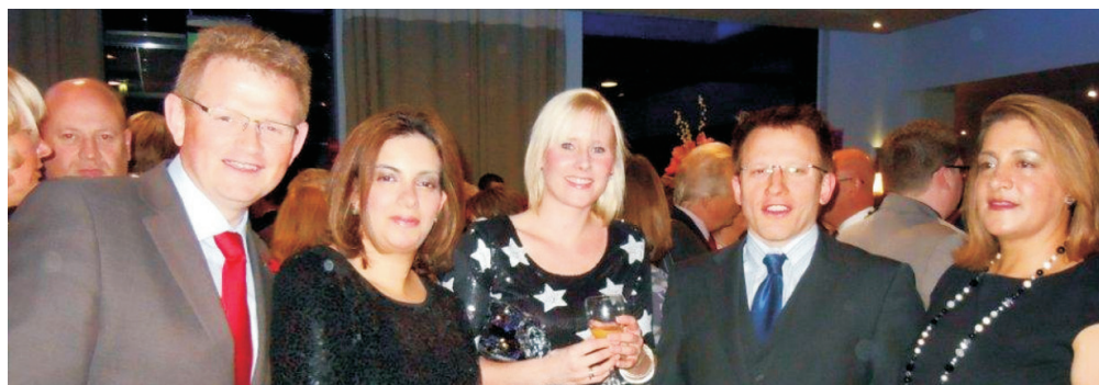
Image: Mentaur team at the Dementia Care Awards, 2011