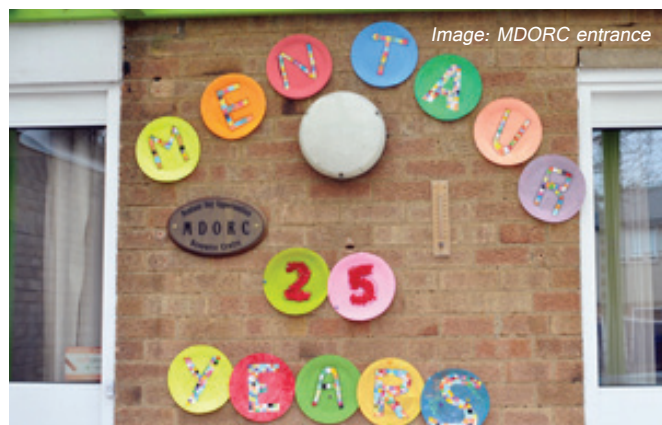
Image: MDORC entrance

On March 22 nd MDORC opened its doors to the community in an interesting open day event with its users of service.